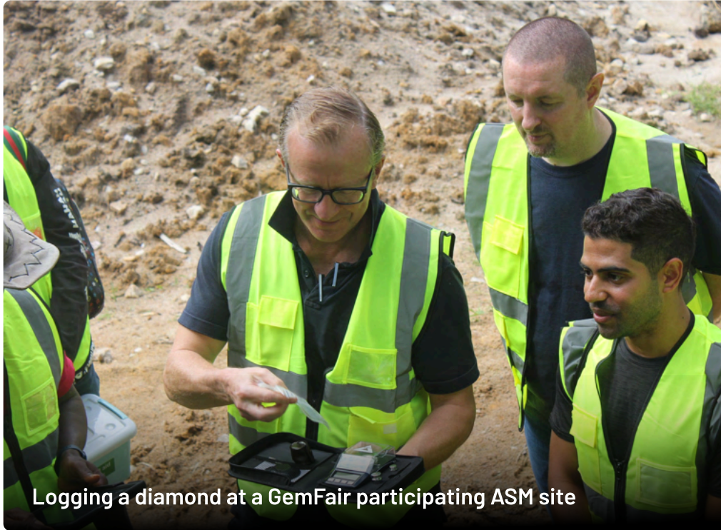
Logging a diamond at a GemFair participating ASM site

In early 2024, De Beers Group and the Government of Angola signed a Memorandum of Understanding (MoU), one component of which involved exploring opportunities to support the formalisation of Angola's ASM sector. In September, GemFair hosted nine representatives from the Government of Angola in Sierra Leone. The visit began in Freetown, Sierra Leone's capitol, where the delegation met with representatives from the Ministry of Mines, National Minerals Agency (NMA) and Precious Minerals Trading Unit.