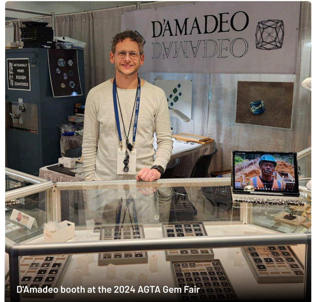
D'Amadeo booth at the 2024 AGTA Gem Fair