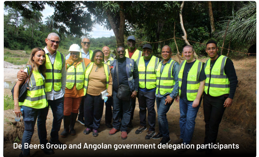
De Beers Group and Angolan government delegation participants

We then hosted the delegation at our buying office, where we had in-depth discussions about GemFair's ASM Assurance Programme, how we use technology and a strong field presence to implement our traceability and chain of custody requirements and how we engage with mining communities.