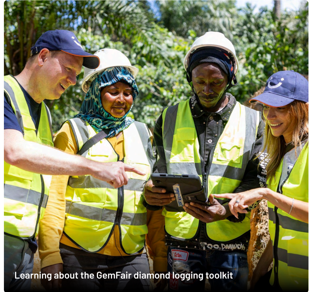
Learning about the GemFair diamond logging toolkit

We widened our membership base significantly and solidified how to make GemFair's Assurance Programme more inclusive, responsive to risk and scalable. In the year ahead, we look forward to exploring new ways to bring GemFair diamonds to market and the exciting opportunities for traceable and responsibly sourced ASM diamonds from the source to store.