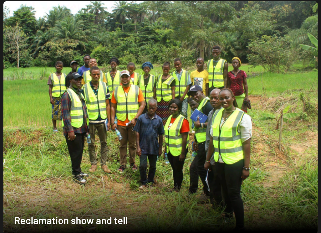
Reclamation show and tell