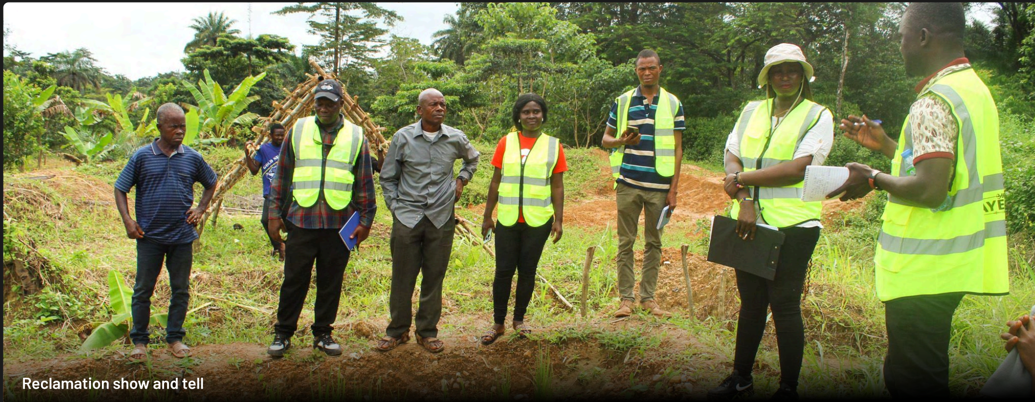
Reclamation show and tell

In September, we hosted a 'show and tell' for civil society organisations and government in Kono. This was an opportunity for us to showcase our reclamation programme and the transformation of former mining land into farms. First, we visited Tongoro 5 – a former mine site that participated in our access to finance programme (Forward Purchase