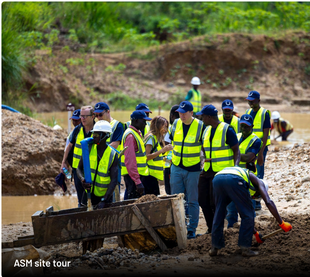
ASM site tour