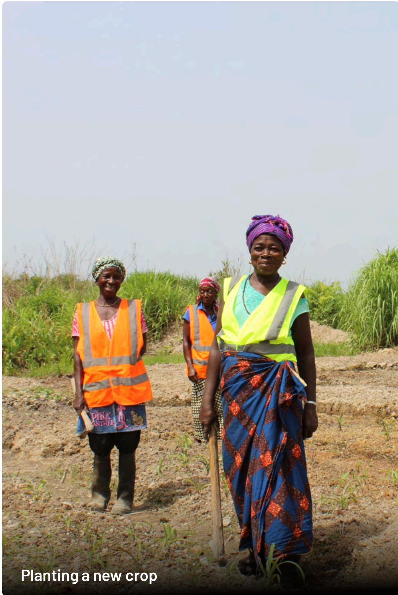
Planting a new crop

"We're the ones supporting the family. Our men are working in the mines, but they don't always find diamonds, so we are the breadwinners. The support of GemFair has helped us keep our children in school. It's no small thing"