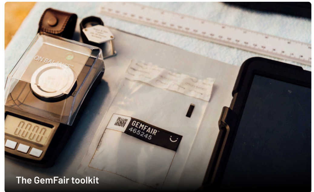
The GemFair toolkit

We have received positive feedback about the other diamond categorisation tools in the toolkit, such as the scale and hand loupe. The scale is especially valuable for miners who end up selling their diamonds to another dealer. With a scale, the miner can be sure of the weight of the diamond and is therefore in a better negotiating position with any diamond dealer they approach subsequently.