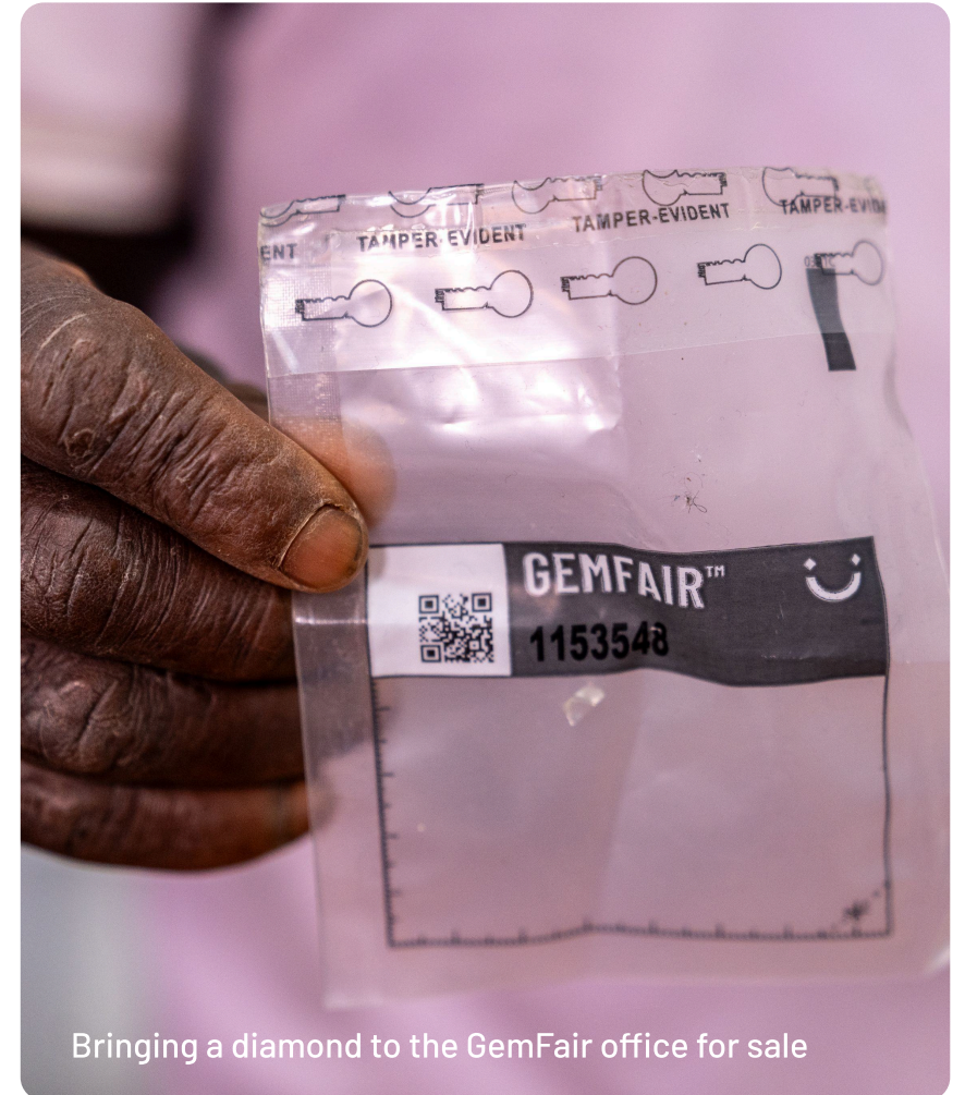
Bringing a diamond to the GemFair office for sale

An independent audit of the GemFair Assurance Programme was completed this year. We are pleased to note that the third-party auditor concluded that GemFair's due diligence management system meets, and in many cases exceeds, the expectations of the OECD Due Diligence Guidance. You can read more about the audit here .