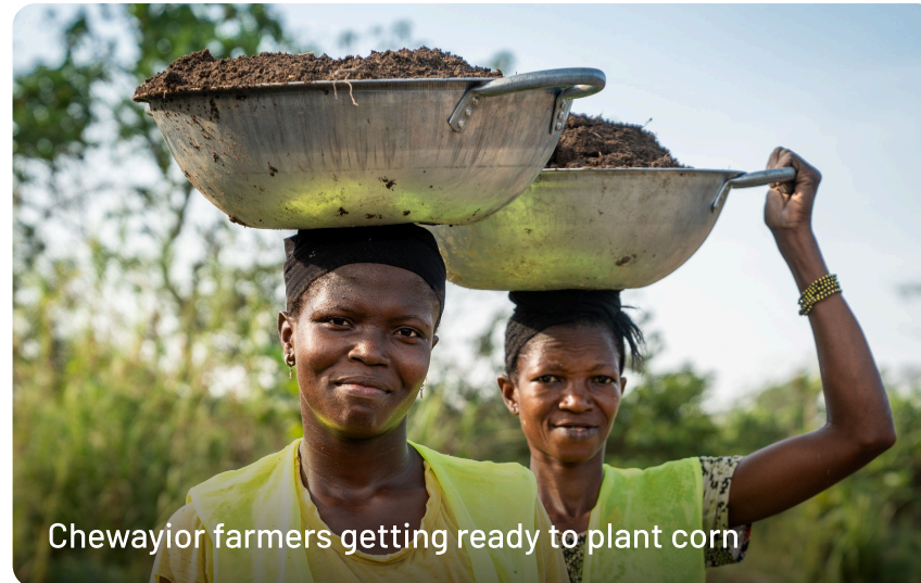
Chewayior farmers getting ready to plant corn

Two years ago, at the behest of a village neighbouring an abandoned mine site, we converted the mine pit into a fishpond, providing a supplemental source of food and income for farmers and their families. In 2025, we refined our approach by introducing an additional fish species to our new fishpond that we converted from an abandoned mine site.