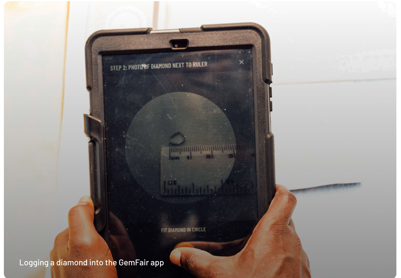
Logging a diamond into the GemFair app

One new feature was to create a dashboard of participating artisanal mine sites to enable real-time updates of photos from mine site visits, diamonds offered to GemFair, and any outstanding corrective action plans for each miner. These data points are displayed in summary and help our field team plan site visits strategically and improve our overall audit trail.