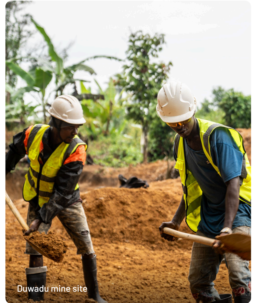
Duwadu mine site

This year, we created 325 fulltime jobs through our access to finance programme.