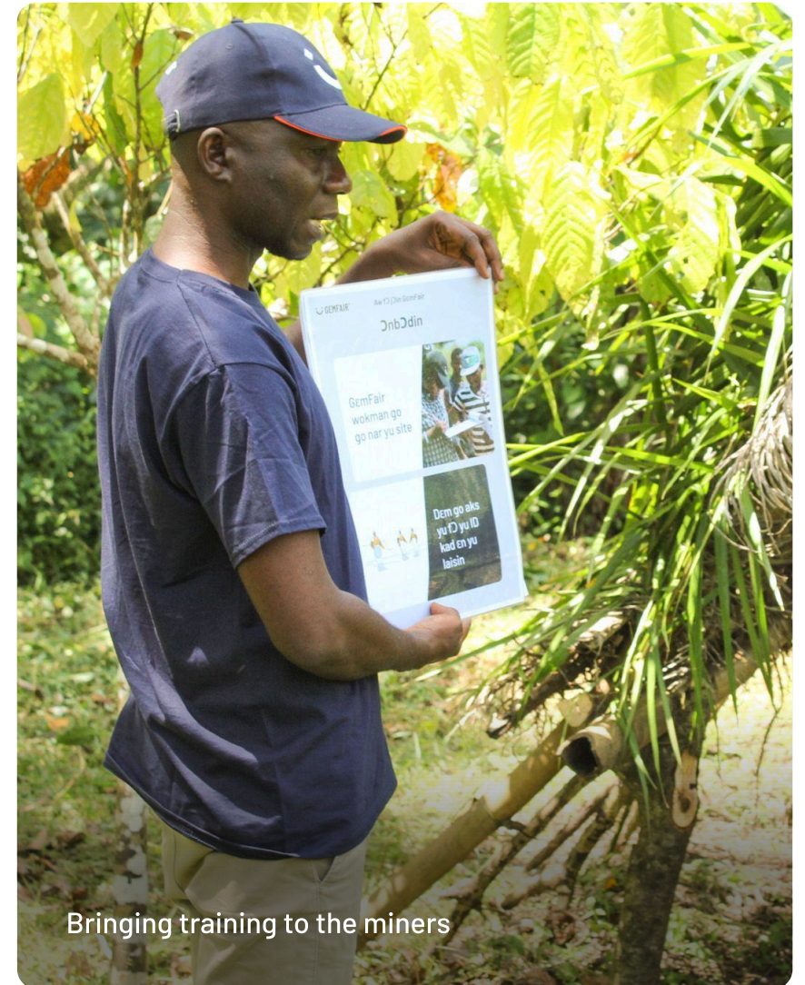
Bringing training to the miners

In 2025, we delivered training to 16 mine sites and a total of 168 people.